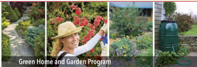
Green Home and Garden Program

Cabrillo Extension in collaboration with the Water Conservation Coalition of Santa Cruz County is offering a series of workshops and classes for home and garden. These classes offer expert instruction on water-saving techniques and conservation principles to help preserve and protect our most valuable resource. Collaboration with Soquel Creek Water District, the City of Santa Cruz Water Department, San Lorenzo Valley Water District, Scotts Valley Water District and the City of Watsonville has helped significantly reduce registration fees as noted below. Space is limited in these classes so register early! Register by June 8: $20 Register after June 8: $25