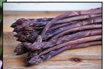
Purple crowns asparagus