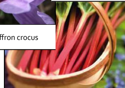
Rhubarb roots Chrimson Red