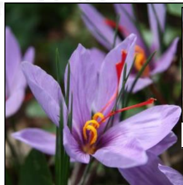
Fall blooming saffron crocus