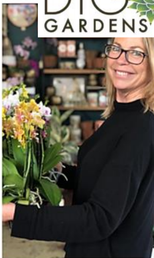
ORCHID 101: REPOTTING AND REBLOOMING | MARCH 4TH @ 3PM $45.00

https://diggardens.com/product-category/workshops/