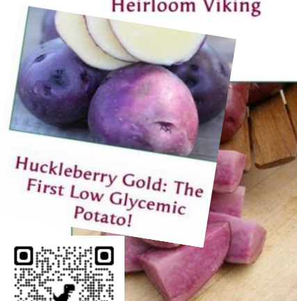
Huckleberry Gold: The First Low Glycemic Potato!