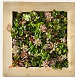
LIVING SUCCULENT FRAME | MARCH 18TH & 19TH @ 3PM $145.00