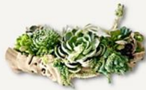
GRAPEVINE SUCCULENT ARRANGEMENT | MARCH 11TH & 12TH @ 3PM $100.00