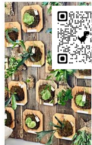
STAGHORN FERN MOUNTING WORKSHOP | MARCH 25TH & 26TH @ 3PM $85.00