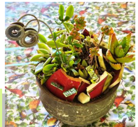
Funky, junky succulent arrangement

Join us! Thursday August 8, 7:00 pm Aptos Grange Hall